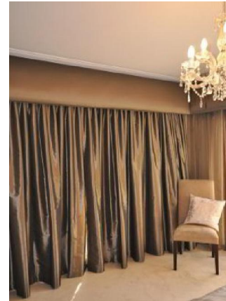
Curtains and pelmets