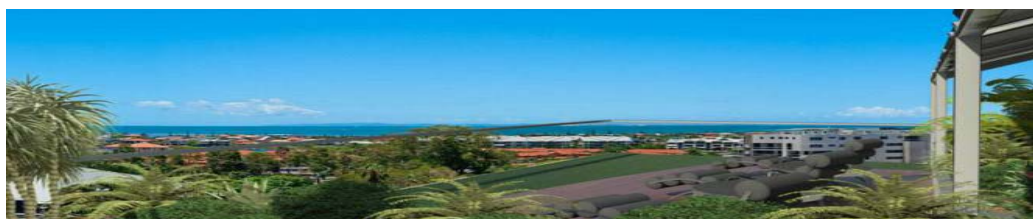
Views to the north-east over Cleveland and Stradbroke Island