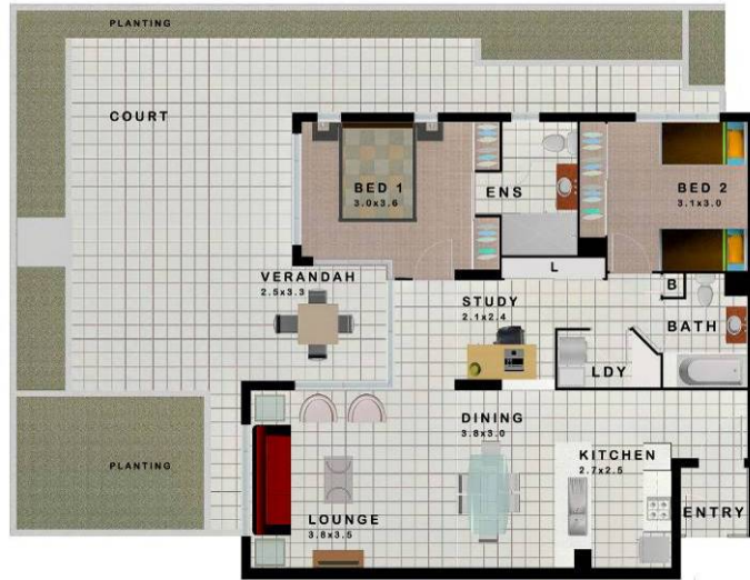
Ground Level - TYPE F