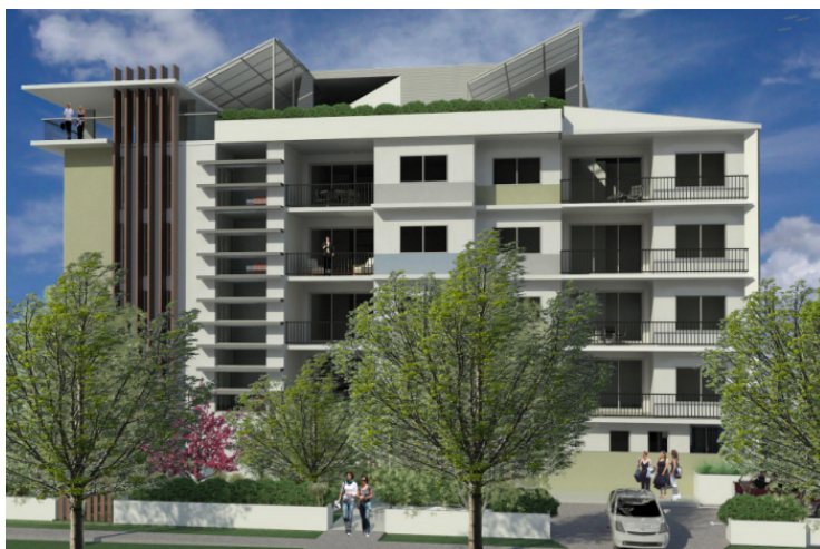
Front of building from Taylor Crescent, Cleveland