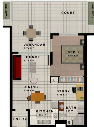
Ground Level - TYPE E