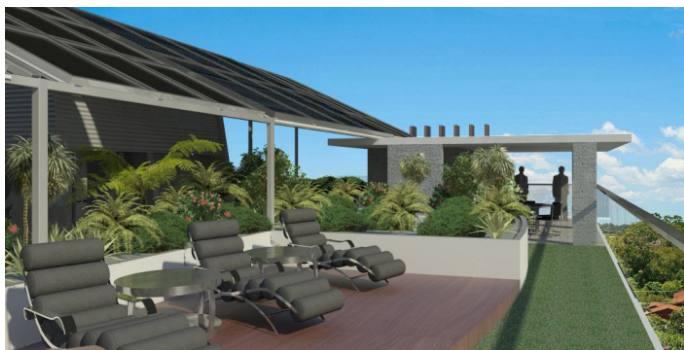
Communal roof garden, facing west

These images do not form part of the Contract for Sale of any lot within the development. They are INDICATIVE ONLY. The descriptions, layouts and areas set out in these images are subject to change and may not accurately reflect the final design depicted.