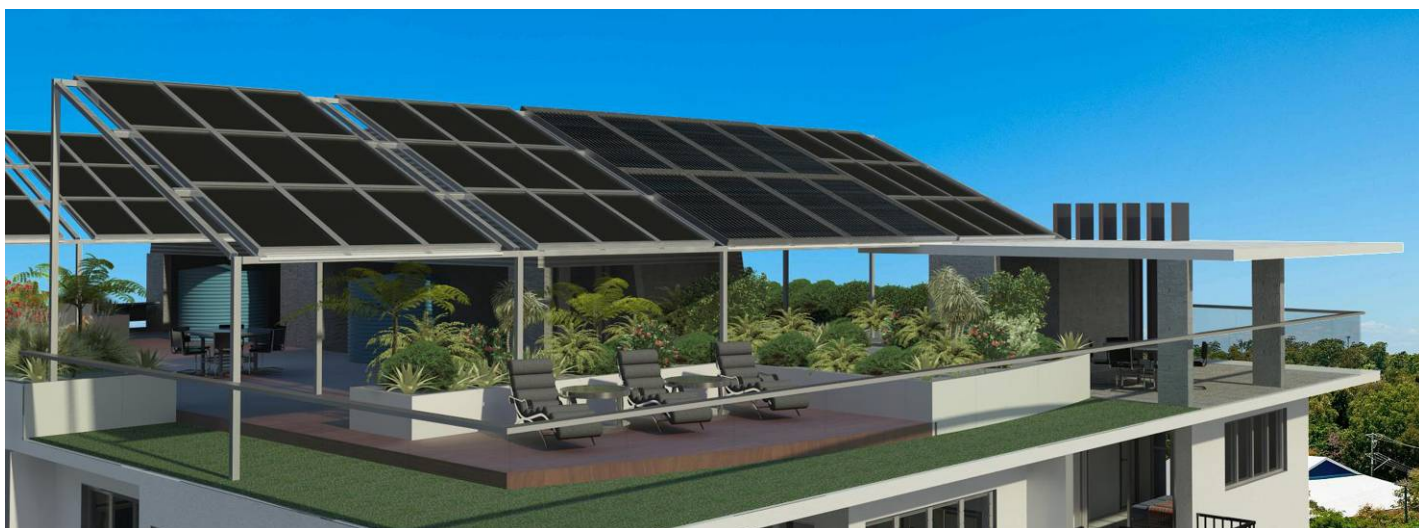
Communal roof garden, from the north