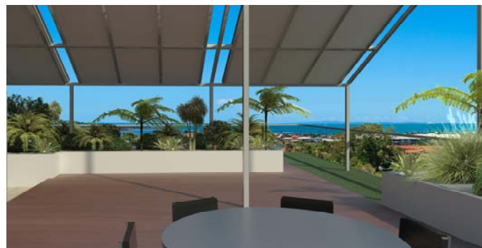
Communal roof garden showing views over the bay to Moreton Island