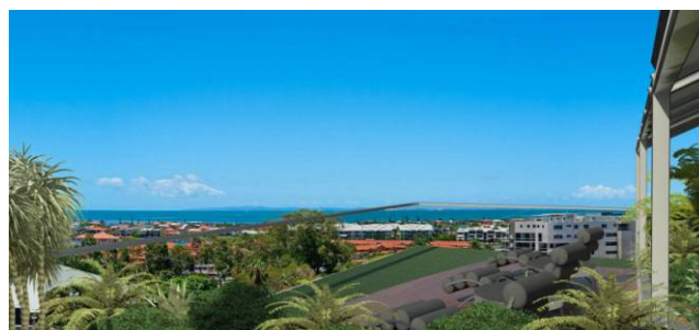
Communal roof garden showing views over the bay to Moreton Island