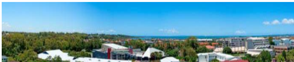
Views to the north-west over Raby Bay to Moreton Island