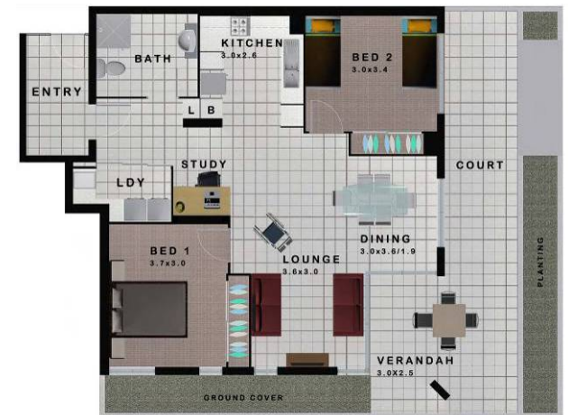
Ground Level - TYPE H

GROUND LEVEL TYPICAL FLOOR PLANS http://www.ecoprodevelopments.com.au/projects/