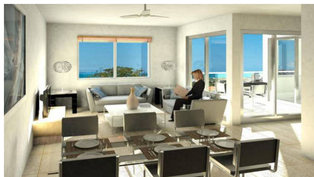
Interior top floor apartment with views over Moreton Bay